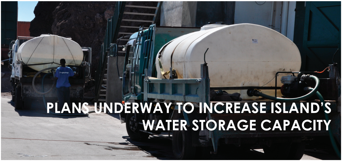
Trucks of the water producers filling up with water from the desalination plants on Fort Bay.

With the ongoing drought on the island, the government believes that the capacity for water storage on the island should be increased. A comprehensive plan that is being financed with funds from the Ministry of Infrastructure and Environment (I&M) and put together with input from stakeholders on the island will be put into place in the coming months.